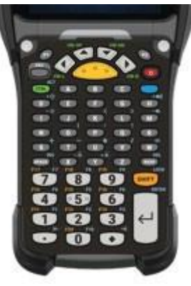
53 Key TE VT