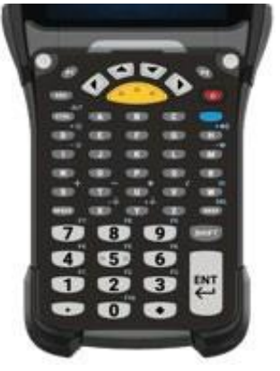
53 Key Standard