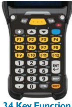
34 Key Function KYPD-MC9334FNR-01