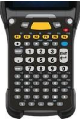
58 Key Func AN KYPD-MC9358ANR-01 KYPD-MC9358ANR-10