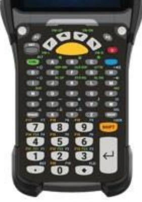
53 Key TE 5250