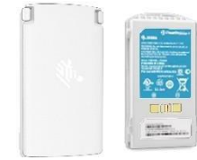
Battery (3300 mAH)