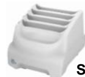
4 slot Battery Charger SAC-TC2W-4SCHG-01